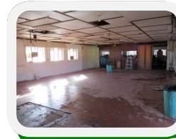
Kitchen Dec. 2017