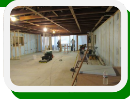
Kitchen Feb. 2018